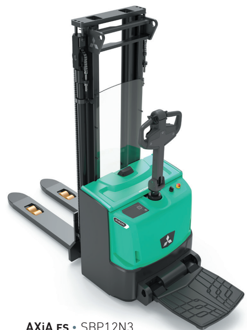
AXiA ES • SBP12N3