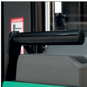
Dashboard protection accessory rack (mini)