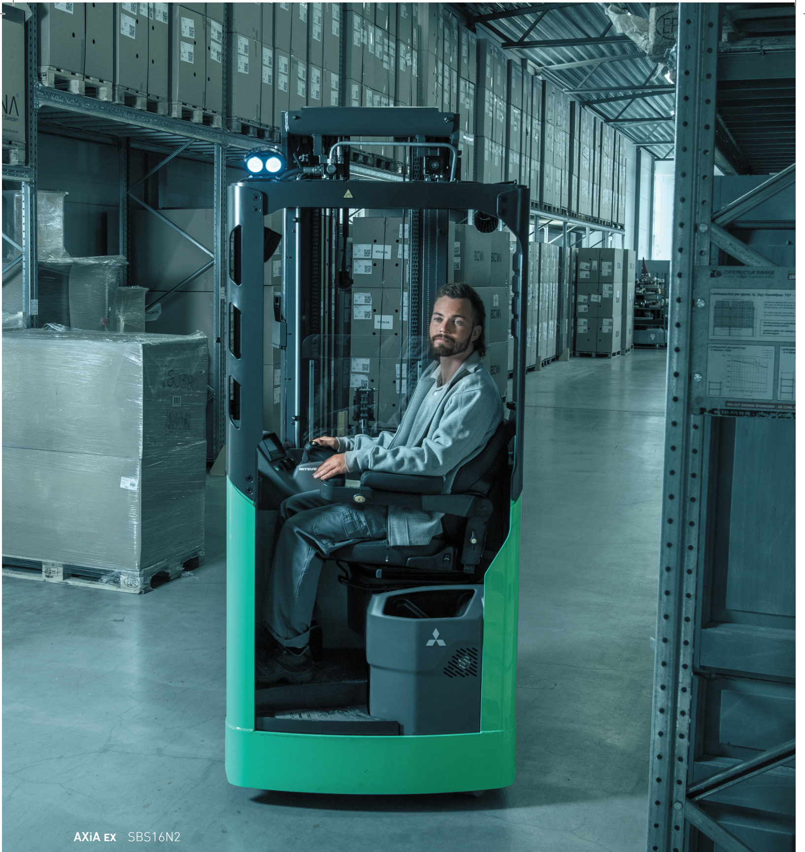
AXiA EX SBS16N2