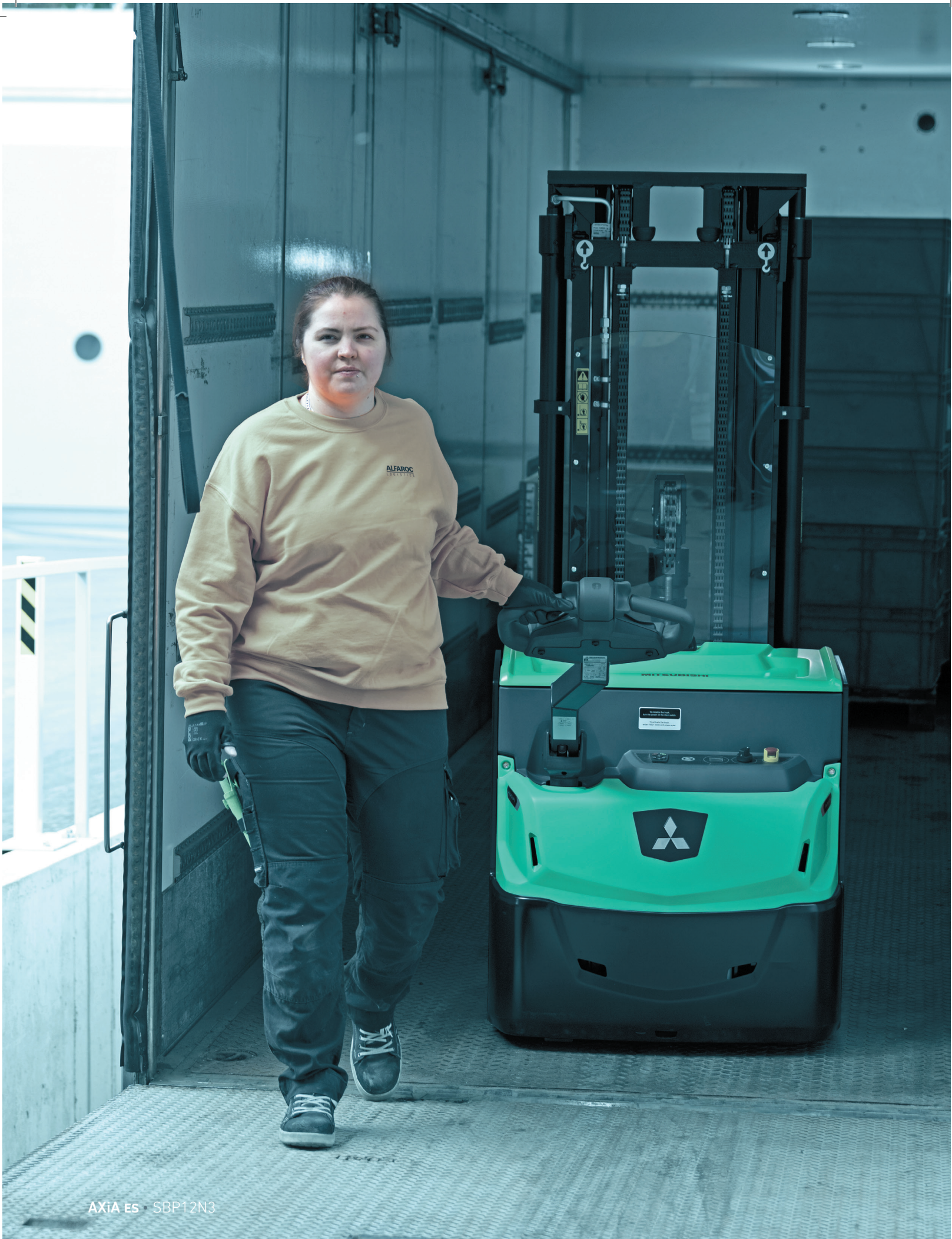
AXIA ES · SBP12N3