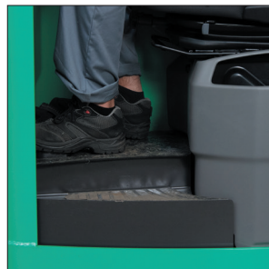
Adjustable floor plate