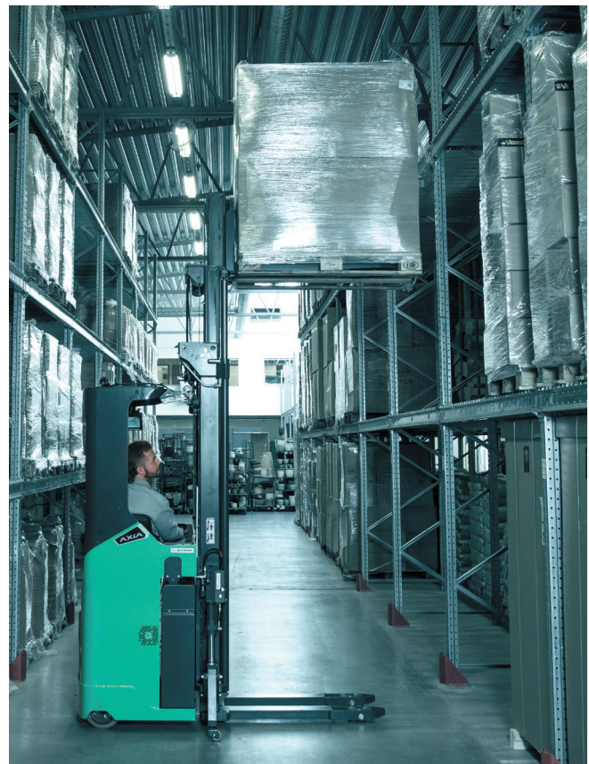
AXiA EX SBS16-20N2 Series