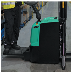
Folding platform & side stabilisers