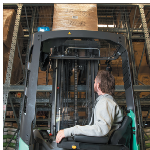
Panoramic ProVision roof