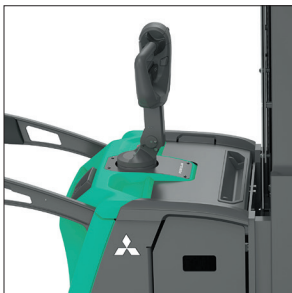
Conventional tiller arm