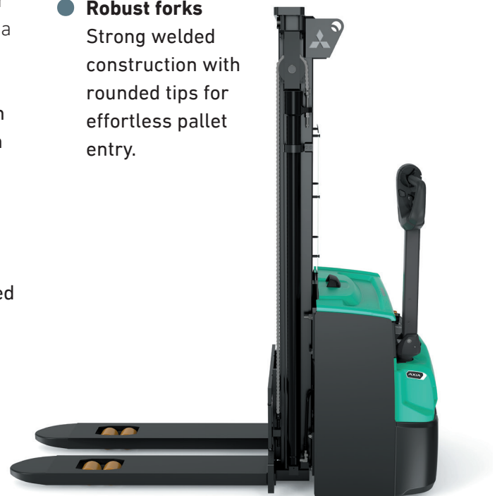
AXiA ES • SBP12N3