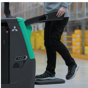
Foldable side bars (Option)