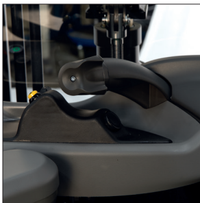
Ergonomic handle with drive control