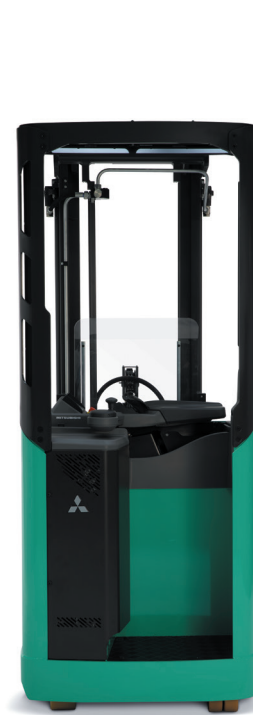
AXiA EX • SBR16N2

With capacities up to 2 tonnes, stand-in and sit-on stacker models are a lower-cost option when lifting up to 7m as reach trucks can often be over-specified for these jobs.