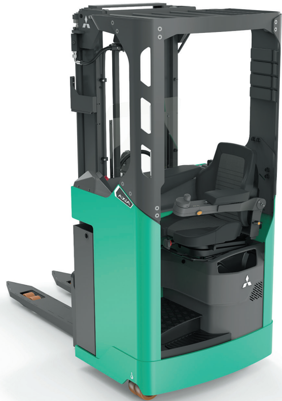
AXiA EX • SBS16N2