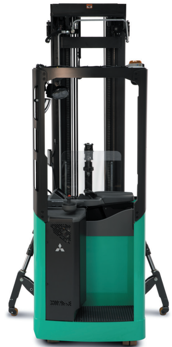
AXiA EX • SBR20N2