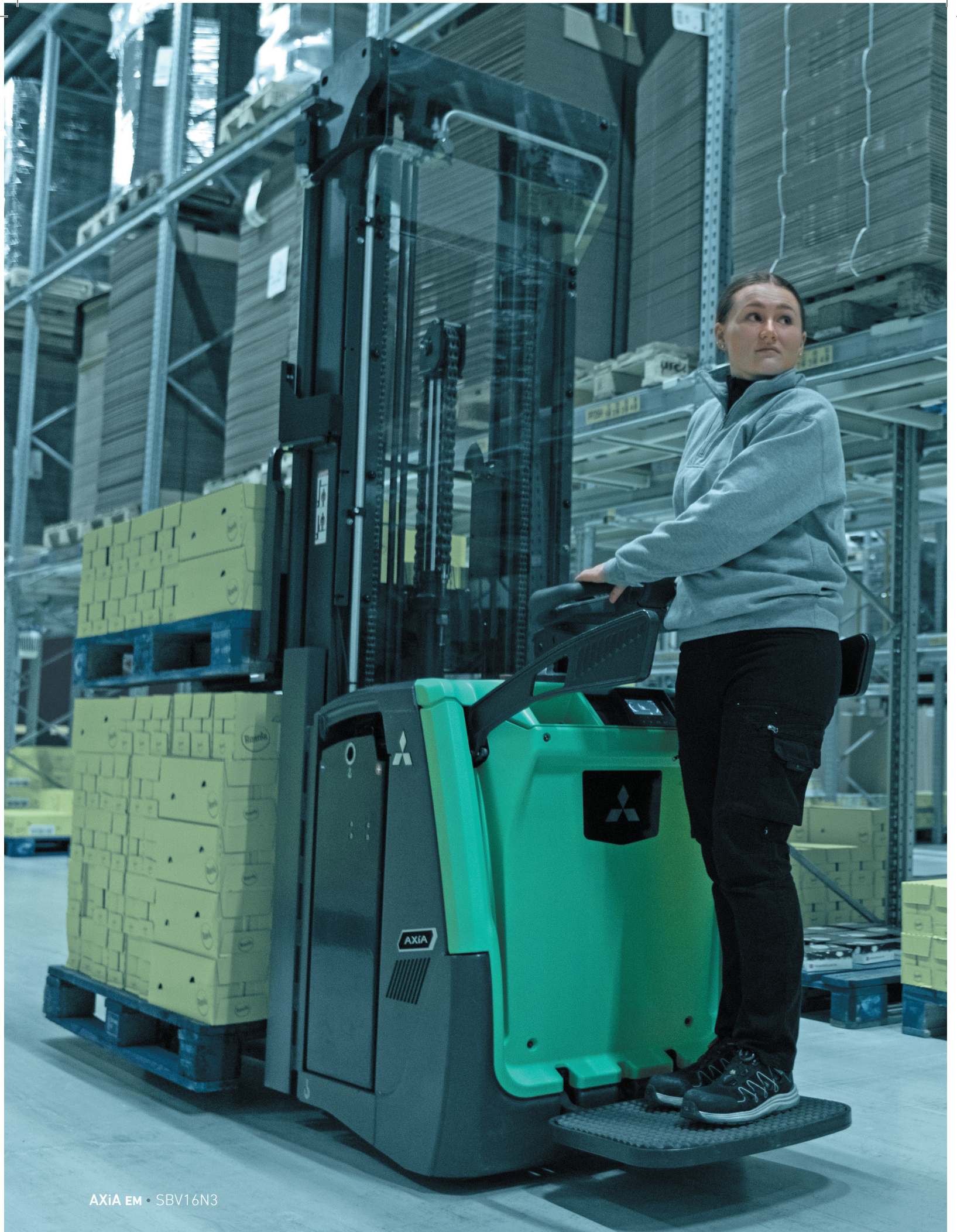
AXIA EM • SBV16N3