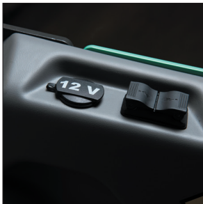
12V DC Power Socket