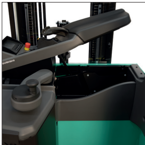
Adjustable armrest storage