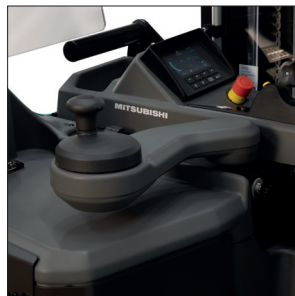
Adjustable steering wheel