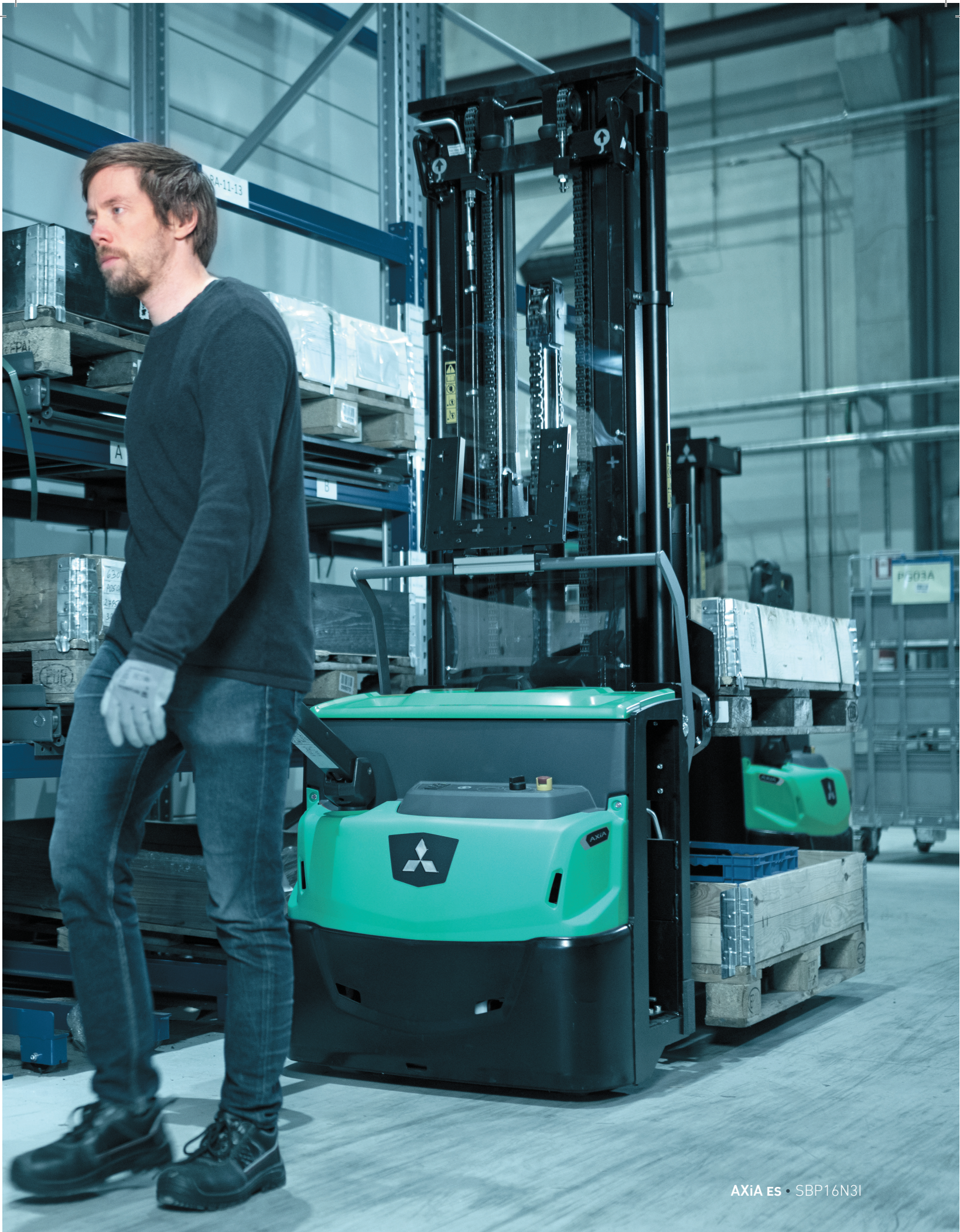
AXiA ES • SBP16N3I