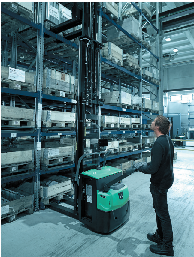
AXiA ES SBP10-16N3(I)(R)(S) & SBP12N2C Series