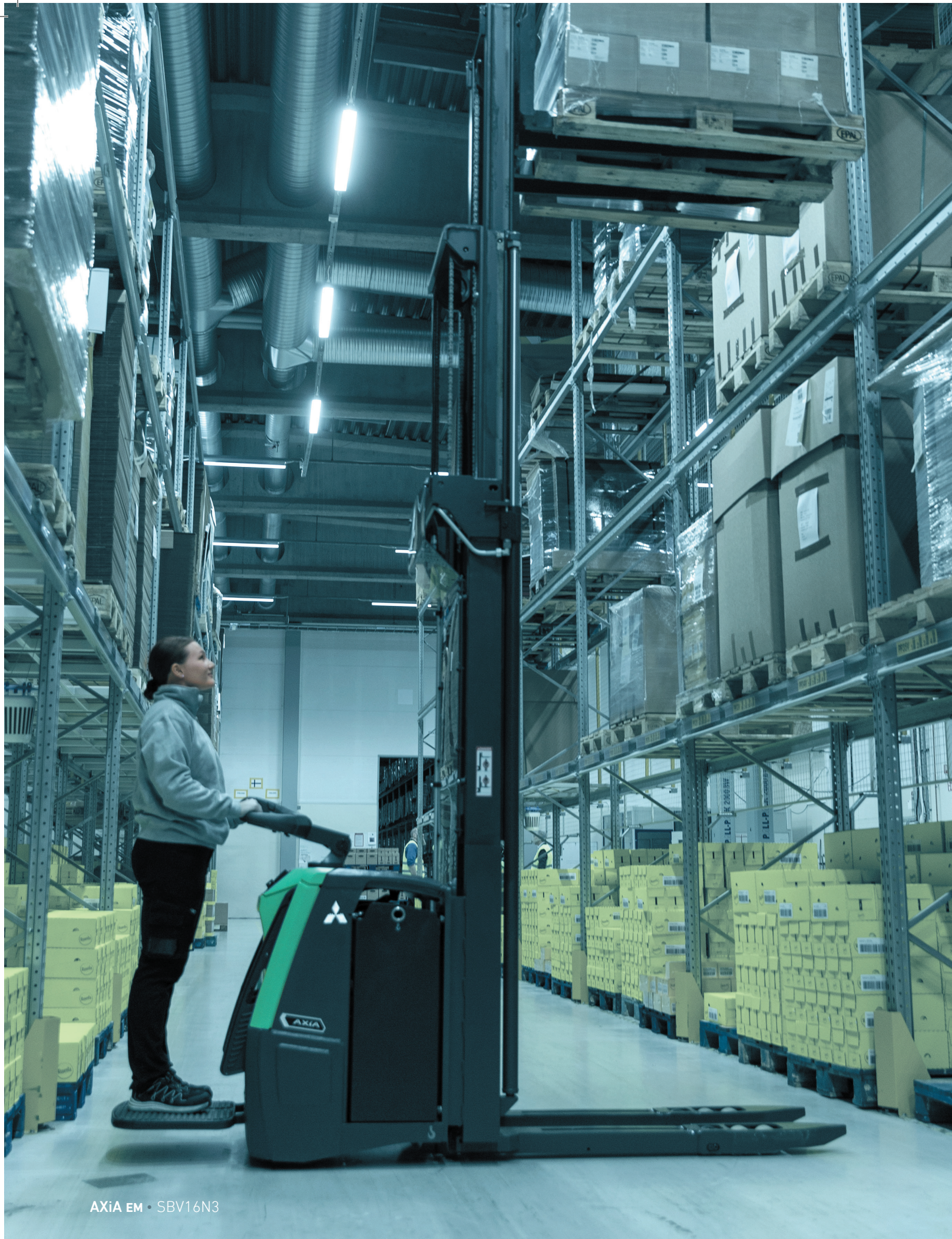
AXiA EM • SBV16N3