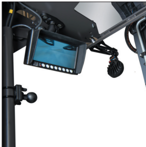
Level assistance system (LAS)