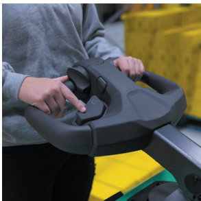
Ergonomic ErgoSteer tiller head