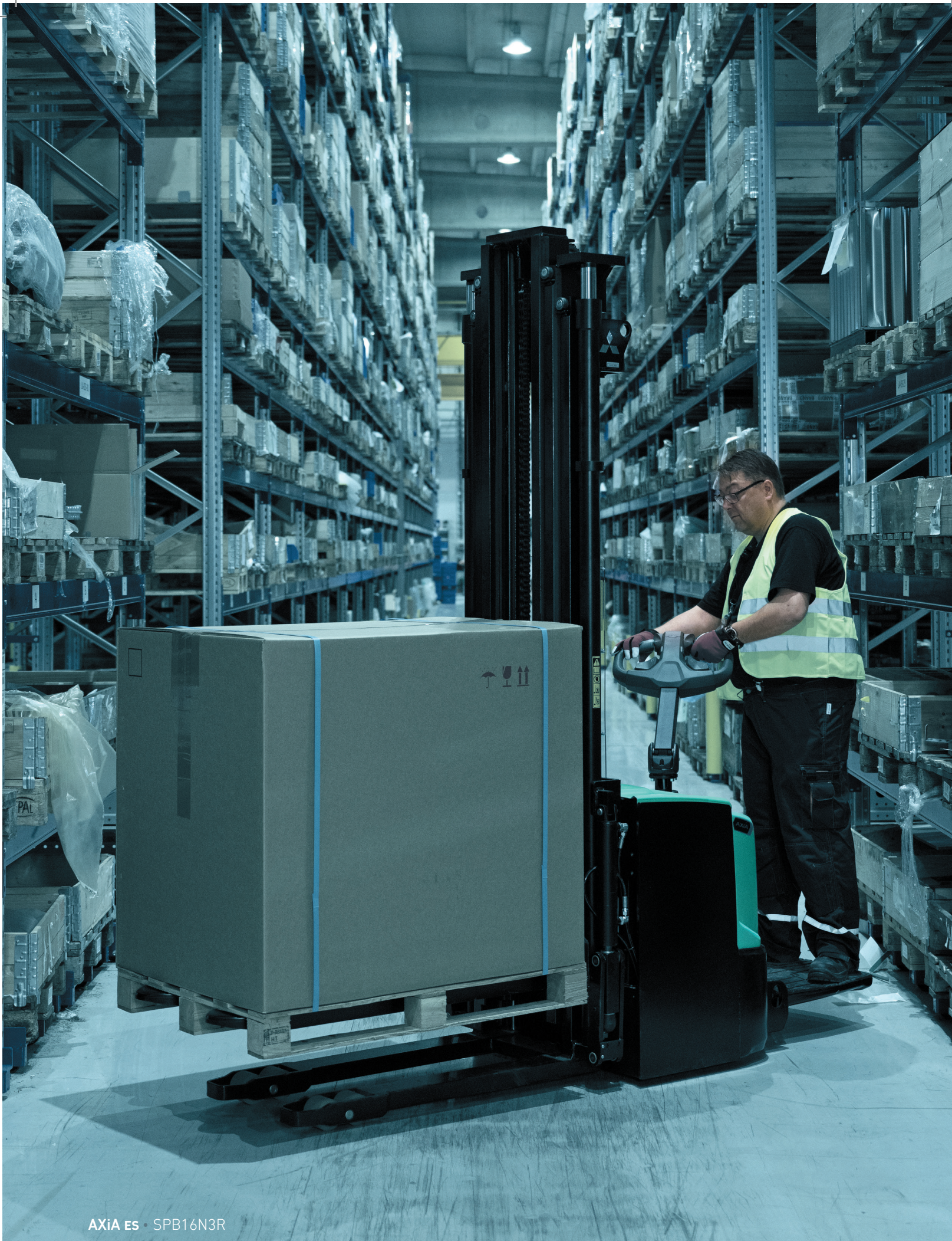
AXiA ES · SPB16N3R