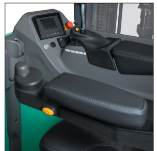
Mini steering wheel with floating armrest