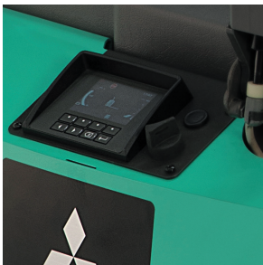
Multifunctional display (SBP12N2C)