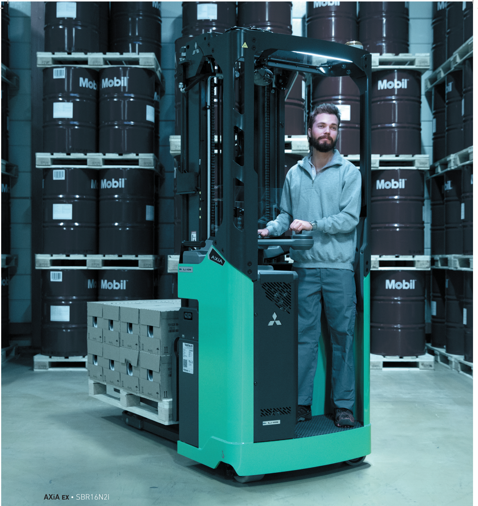
AXiA EX • SBR16N21