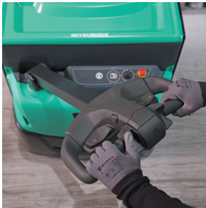
Easy-to-operate tiller arm