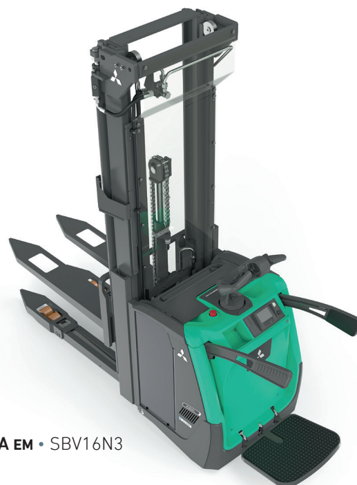
AXiA EM • SBV16N3

This allows for better ground clearance on ramps, inclines, and uneven floors, and allows for double pallet handling. (I models only)