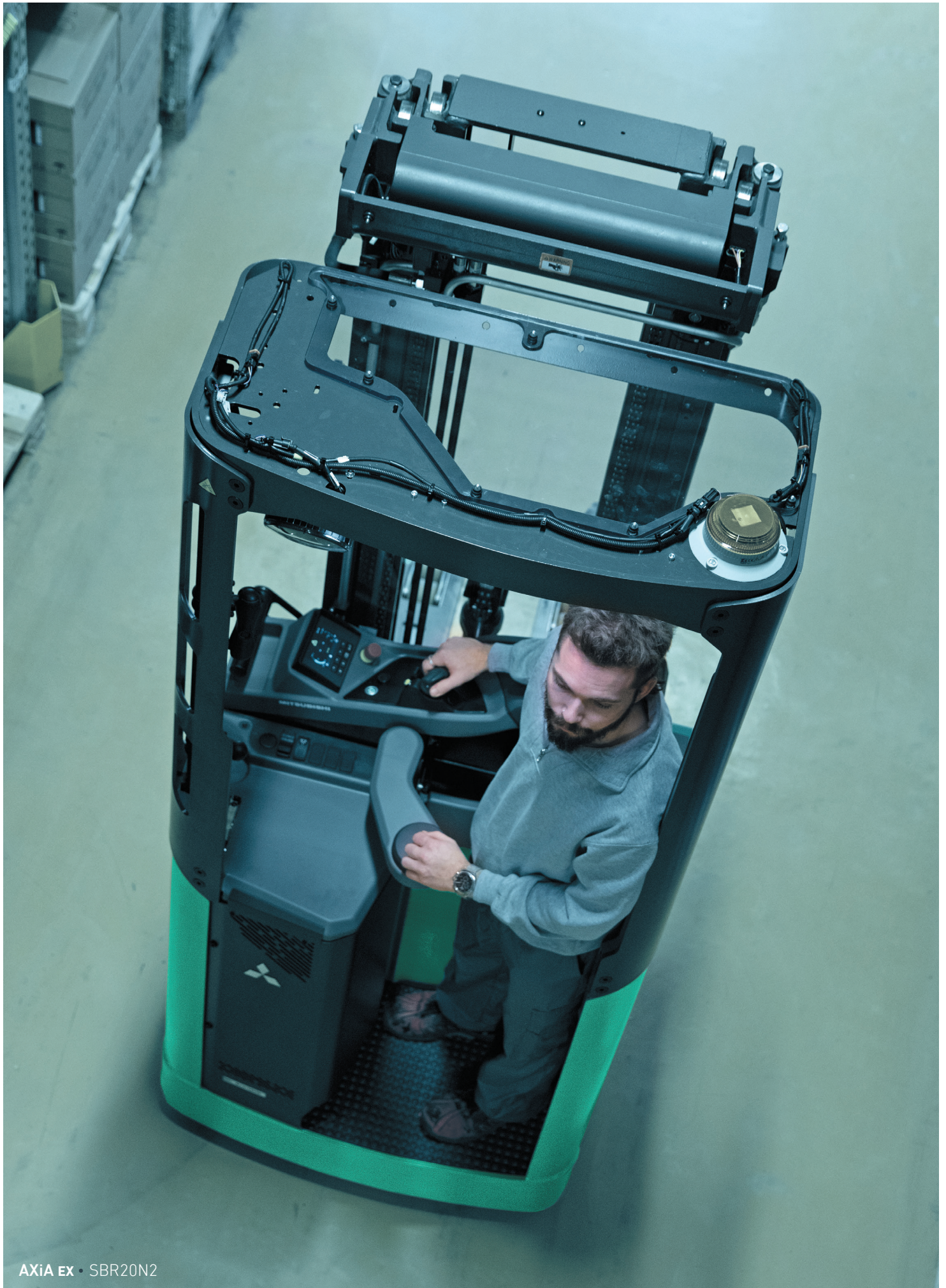
AXiA EX · SBR20N2