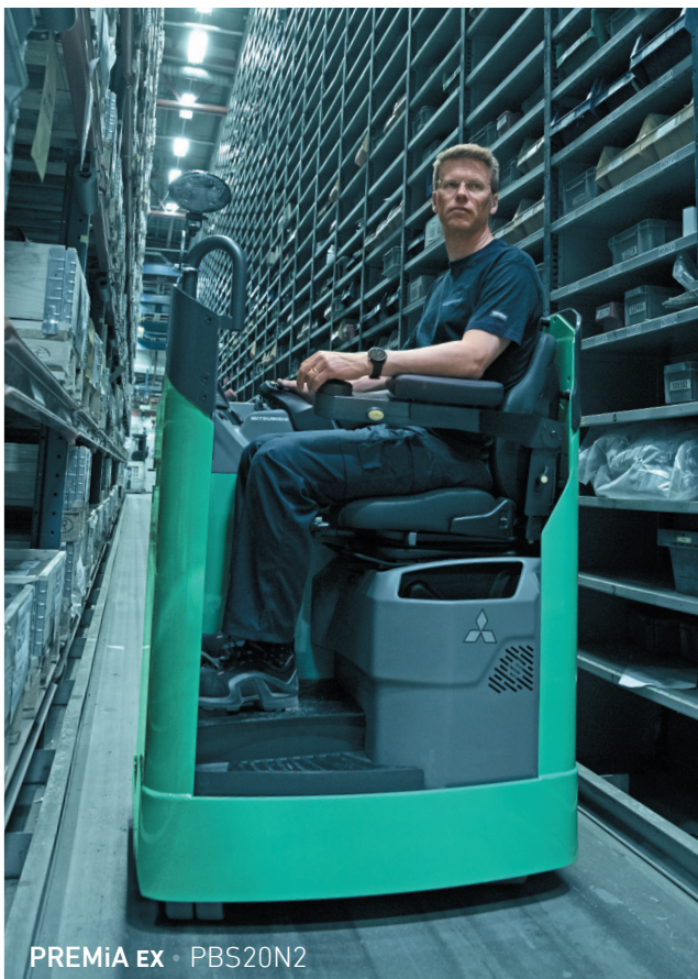
PREMiA EX · PBS20N2