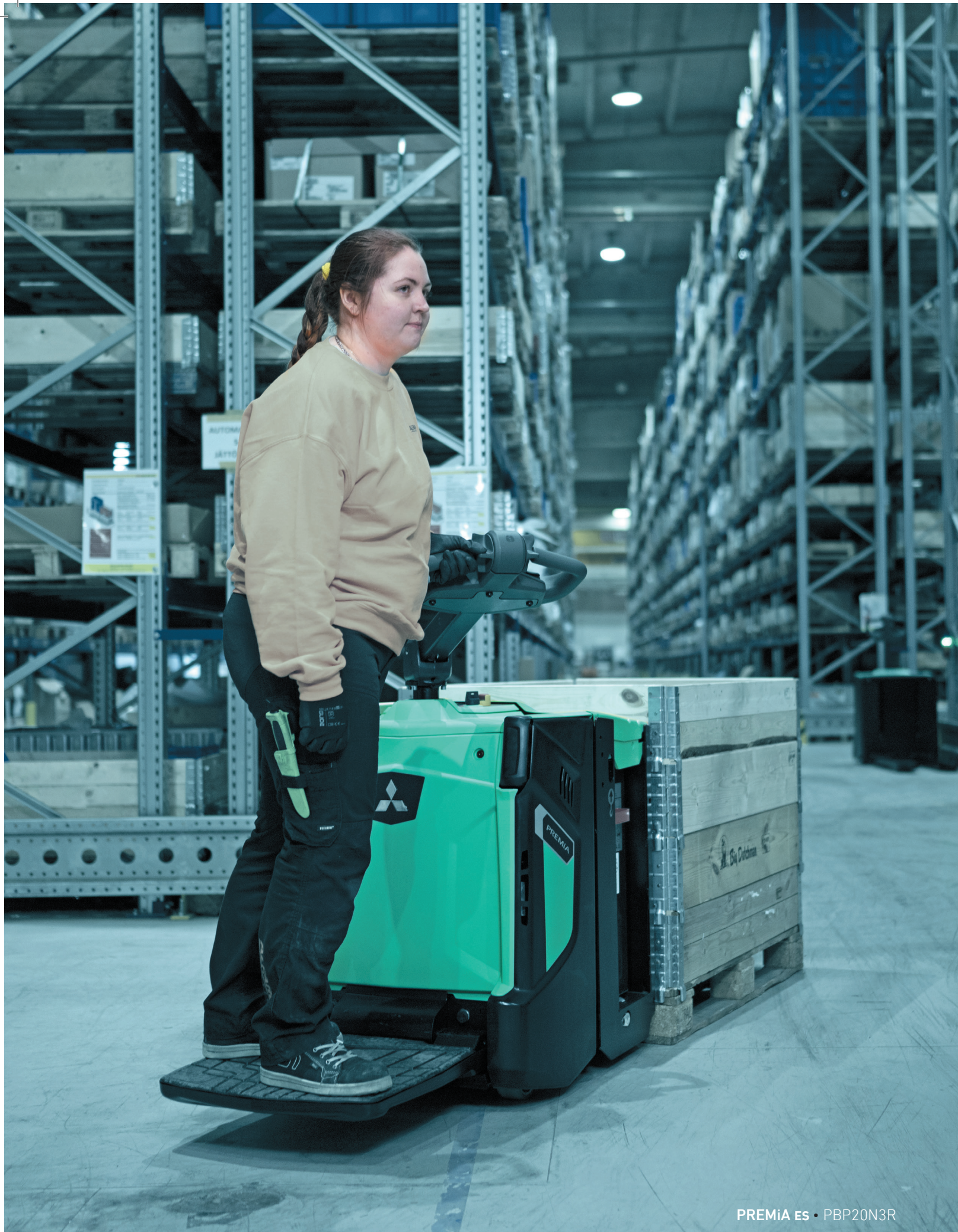
PREMiA ES • PBP20N3R