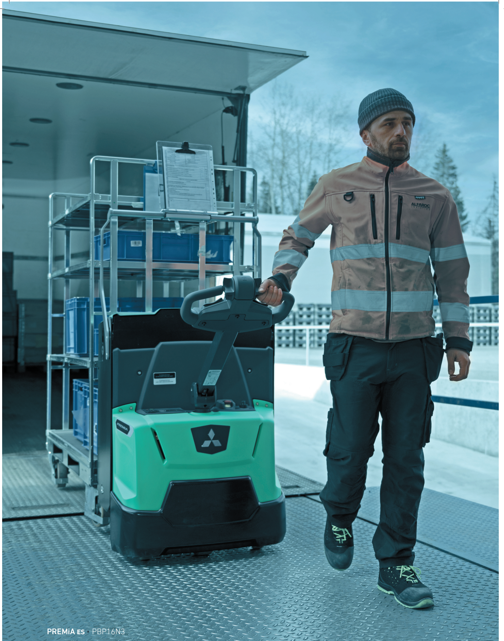
PREMiA ES · PBP16N3