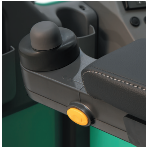
Dynamic Power Steering