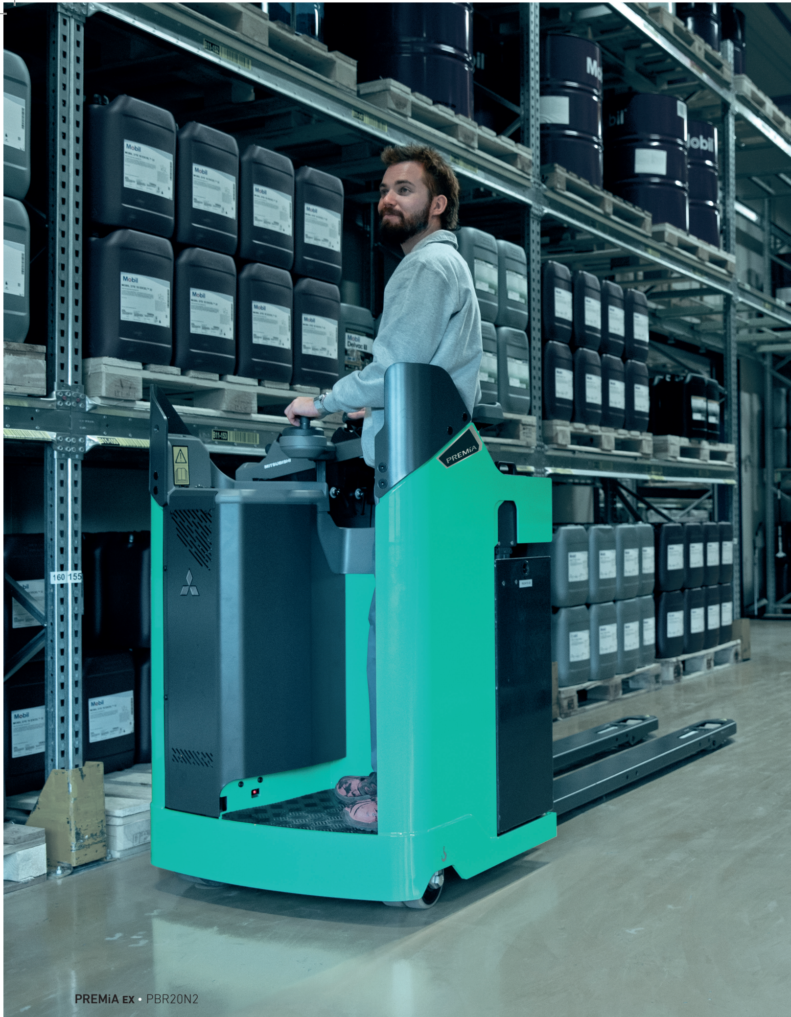
PREMIA EX • PBR20N2