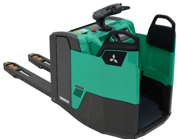
PREMiA EM • PBF20N3R

Fitted as standard for battery protection and preventing deep discharge.