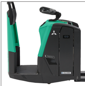
Ultra-low step height