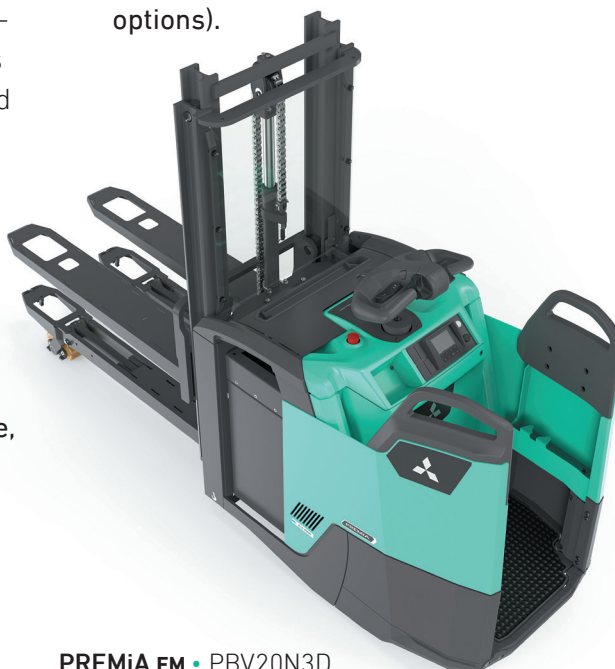
PREMiA EM • PBV20N3D

Spring-loaded system works with DriveSteady to continuously increase pressure of the drive wheel. This ensures optimum traction on wet surfaces for better productivity and minimal risk of accidents. (Available on mechanical and power steering options).