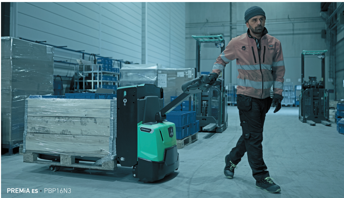
PREMiA ES • PBP16N3