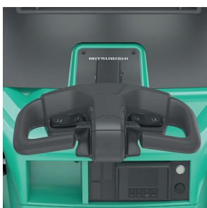
ErgoSteer tiller head