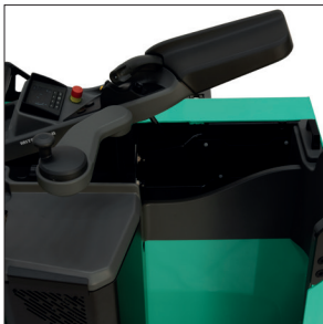
Adjustable armrest storage