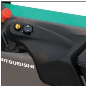
Direction switch on handle