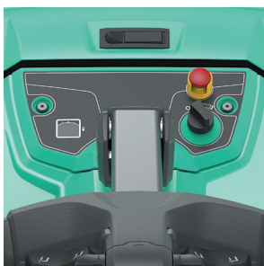
Advanced programmable controller