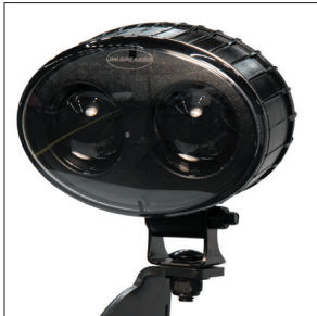
LED working lights