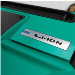
High capacity batteries