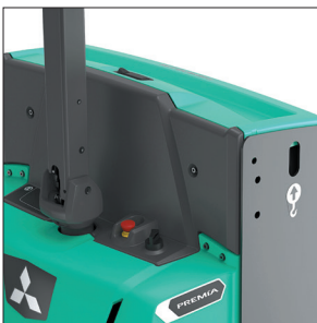
Hingeless steel battery lid

Developed for non-stop performance in the most challenging environments, PREMiA ES pedestrian power pallet trucks help you go the distance. Thanks to its sealed protective chassis and waterproof components (rated to IP54), PREMiA ES is unaffected by dirt, debris, dust, and water, working dependably indoors or out with minimal maintenance.