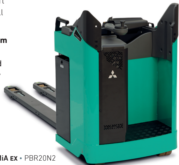
PREMiA EX • PBR20N2

The operator can keep the truck in constant motion — saving seconds on every turn.