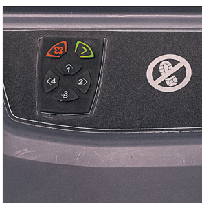
PIN code log in