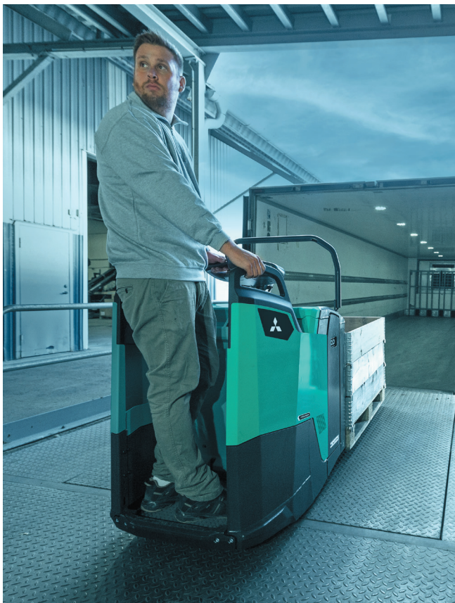
PREMiA EM PBV/PBF20-25N3(R)(S) Series

Combine with Mitsubishi Forklift Trucks stability enhancing technology such as DriveSteady and TractionPlus and you'll see why powered pallet trucks are a safe, smart, and cost-effective choice.