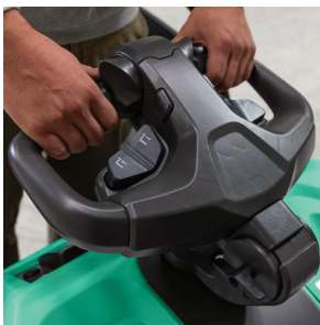
ErgoSteer tiller head

The PREMiA EM range is available in three variations: foldable platform, fixed platform rear entry, and fixed platform side entry. Each truck is available in either 2 tonne or 2.5 tonne capacities. All trucks feature a heavy-duty chassis in 3 possible sizes: mini, junior and senior to suit all battery requirements. The mini chassis is also the shortest on the market.