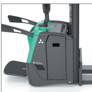
EasyRide adjustable dampening system

The PREMiA EM double pallet handler is built for highly demanding work where performance and precision are key. It's available in both fixed platform and folding platform configurations with fast acceleration and drive speeds, and market-leading lifting and lowering speeds. The initial lift feature allows for higher ground clearance when needed and allows for the transportation of stacked pallets, doubling productivity, and reducing the time needed to move them from A to B.