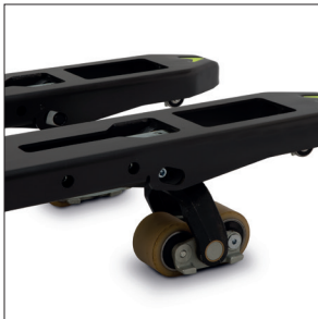
Tapered and angled fork tips

For horizontal transport over medium-to-long distances, ensure your operators have the comfort and safety benefits of a stand-in power pallet. The ergonomic controls, comfortable operator compartment, and easy entry and exit make longer shifts stress-free and far less fatiguing for the drive