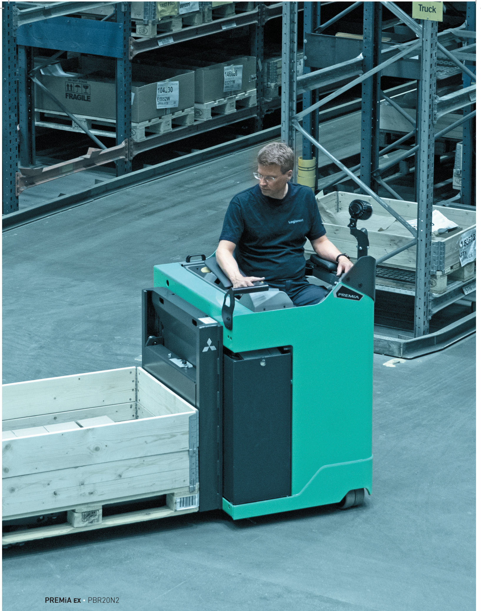
PREMIA ex • PBR20N2