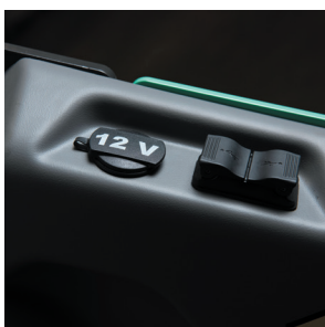
12V DC Power Socket