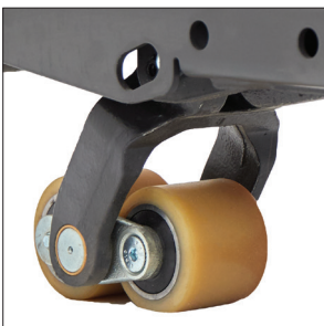
Dust-shielded load wheels