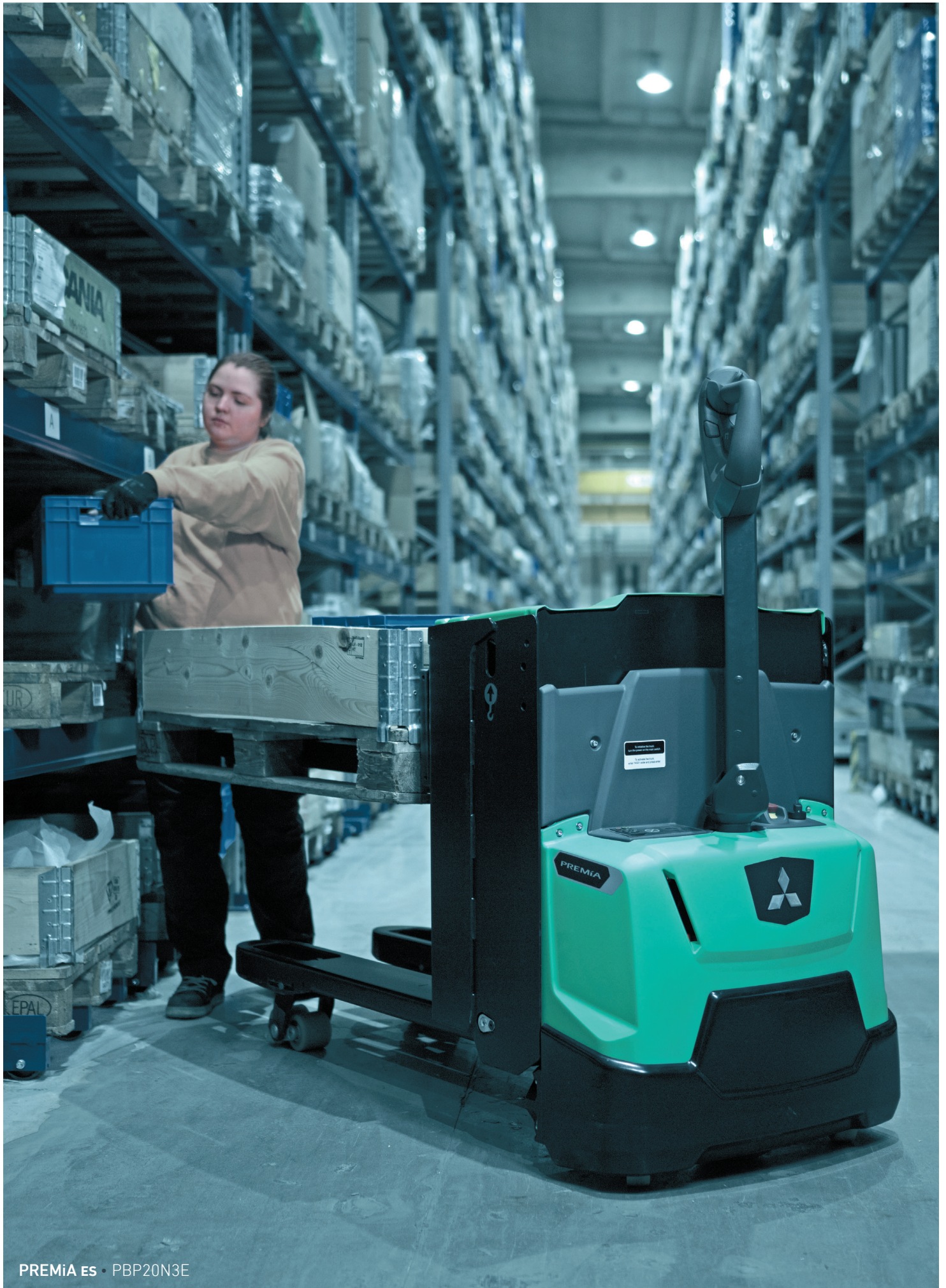
PREMIA ES • PBP20N3E