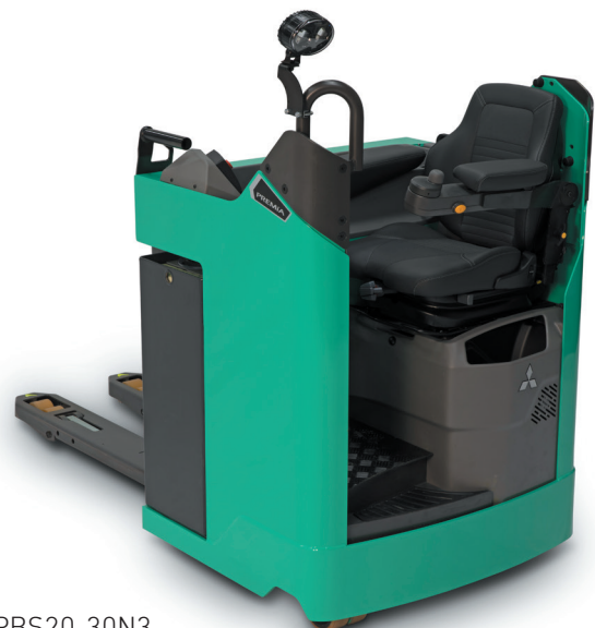
PREMI A EX • PBS20-30N3