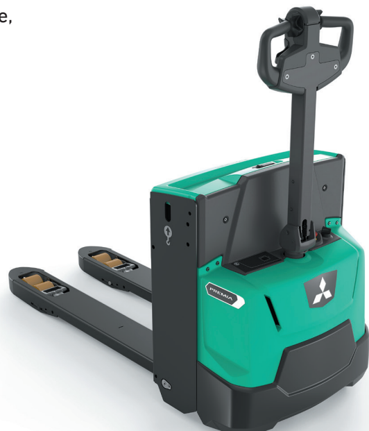
PREMiA ES • PBP160N3