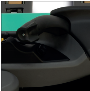
Ergonomic handle with drive control