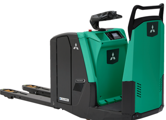
PREMiA EM • PBF20N3S

Different driver modes: PRO for advanced drivers, ECO for low energy consumption, Easy for sensitive goods or beginners.