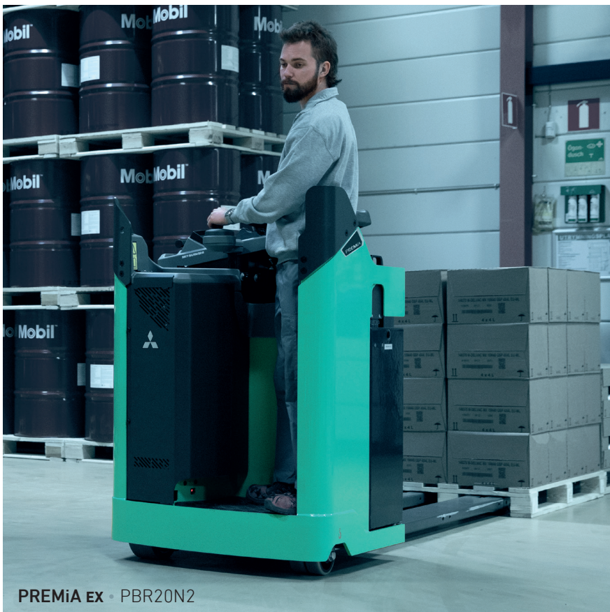
PREMiA EX • PBR20N2