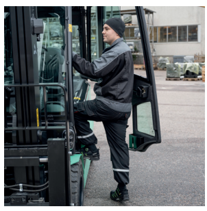
Easy on/off access