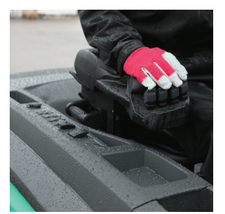
Works in any weather

4-wheel solid pneumatic tyres 80V AC Power 2.5–3.5 tonnes