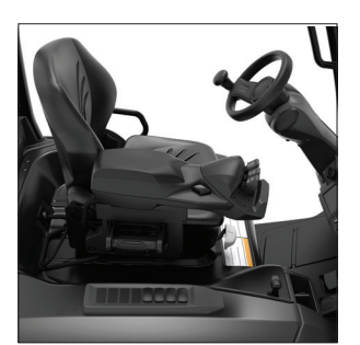
Fully featured cabin

3 and 4-wheel solid pneumatic tyres 48V AC Power 1.4-2.0 tonnes