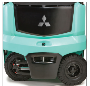
Rear axle steers more than 100 degrees