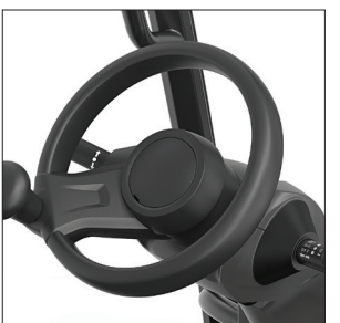
Comfortable steering position