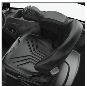
Ergonomic seat and armrest