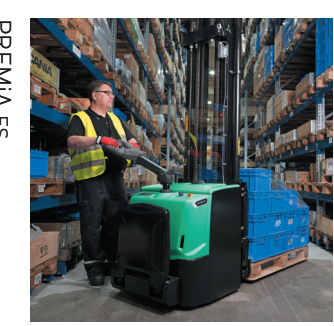
Compact and easy to use, our versatile stackers, including the popular AXiA , ensure high productivity whatever the setting.