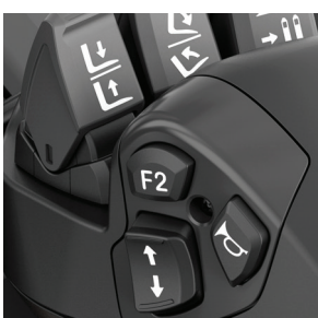
F2 thumb button