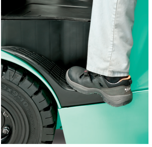
Extra-large entry step