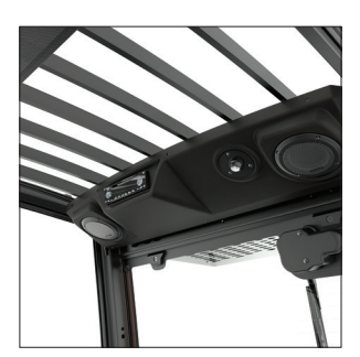
Clear-view overhead guard

It is well known that if an operator is comfortable they will be more productive. EDiA XL features a rubber-sealed cabin that minimises micro-vibrations, and the overall noise level inside the cabin is just 65 dB.