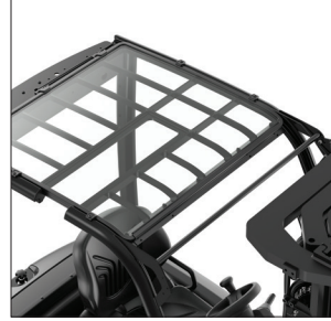
Optional acrylic roof