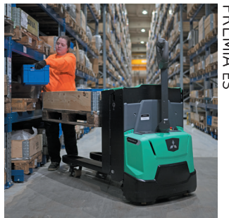
These non-stop performers offer a huge range of transfer possibilities: from short shuttle work to applications which go the distance.