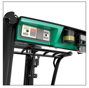
Optional lighting kits