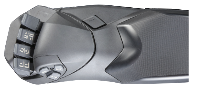
ErgoCentric adjustable armrest with integrated fingertip control