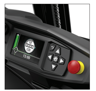
Bright and clear display