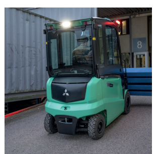
Automatic parking brake with hill hold

Everything about EDiA EX inspires confidence. Our design team worked to build something that's robust yet nimble, technologically advanced yet completely intuitive to control. EDiA gives you confidence to do the job knowing it'll always be up to the task, every time. With Four Wheel Steering and impressive residual capacities you get bigtruck performance that works in tight spaces. And AutoBoost means you'll never feel like you're lacking power.