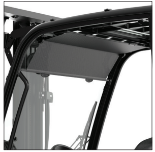
Optional sun visor