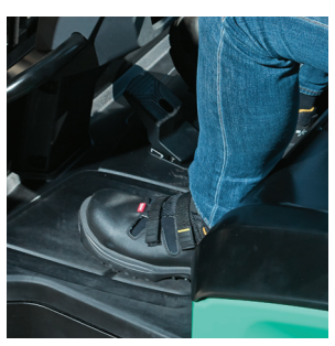
Large floor space