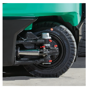
100-degree steering axle