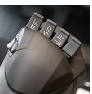
Responsive fingertip control