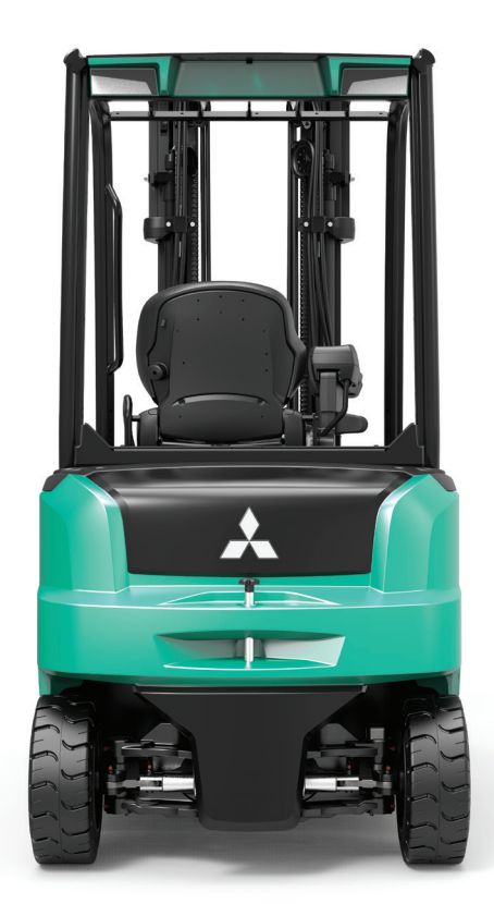
EDiA EM • FB20N2

Build for the most important part and everything else will follow.