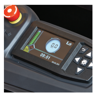
Clear, informative display

4-wheel solid pneumatic tyres 80V AC Power 2.5–3.5 tonnes