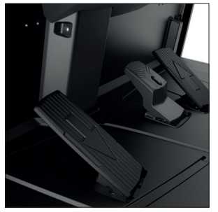
Dual pedal layout option