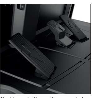
Optional direction pedal