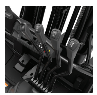
Manual lever control

Smart. Safe. Agile. EDiA EM is a lot of truck in a compact package. Legendary Mitsubishi Forklift Trucks engineering, exceptional ergonomics, and cutting-edge technology — like AutoBoost and Adaptive Lift Control — combine to make EDiA a favourite of drivers and businesses alike.