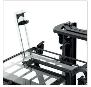
Crane segment option