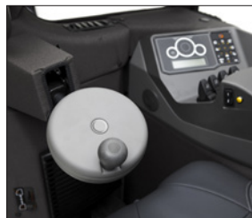
Midi steering wheel