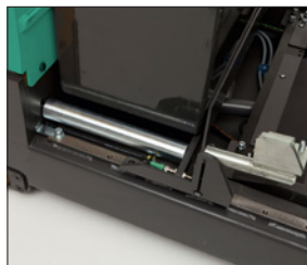
Battery on rollers