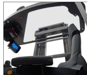
Panoramic MaxVision roof