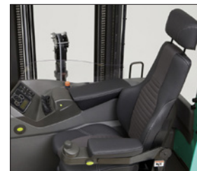
Headrest for seat