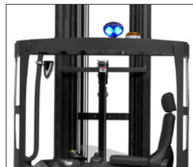
Blue point safety light